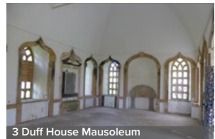
3 Duff House Mausoleum