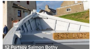
12 Portsoy Salmon Bothy