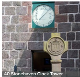
40 Stonehaven Clock Tower