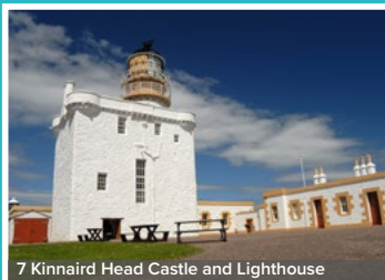
7 Kinnaird Head Castle and Lighthouse

Aberdeenshire Architecture Heritage Design