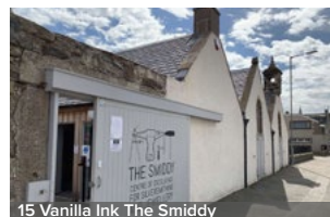
15 Vanilla Ink The Smiddy