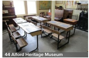
44 Alford Heritage Museum