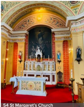
54 St Margaret's Church