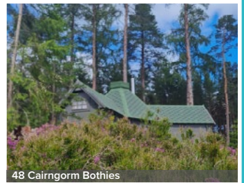
48 Cairngorm Bothies