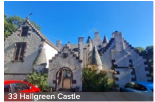
33 Hallgreen Castle

https://www.facebook.com/AberdeenshireArchitectureHeritageDesign/