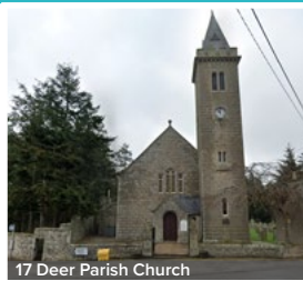
17 Deer Parish Church