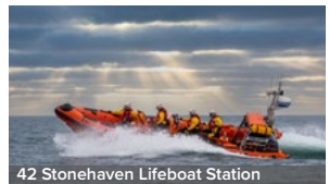
42 Stonehaven Lifeboat Station