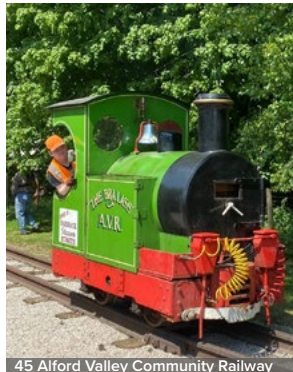
45 Alford Valley Community Railway